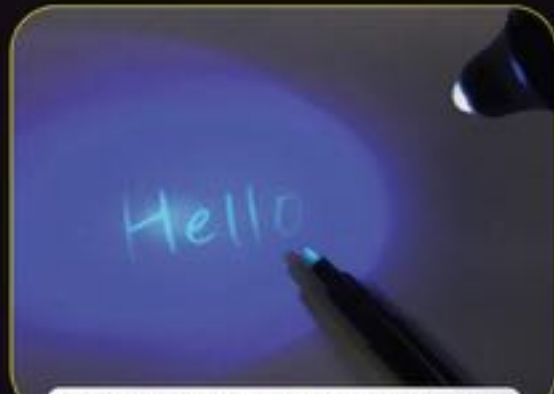
a spy pen with a black light lamp

We can see UV light with a black light lamp.