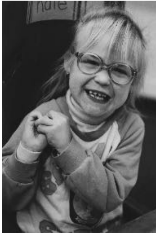
FIGURE 1.3 Stereotypic hand movements in Rett's syndrome