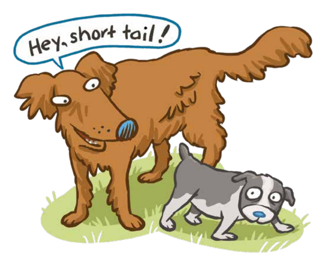
Sometimes teasing is meant to be friendly . . . but feels hurtful.

Sometimes teasing isn't meant to be friendly at all. Mean teasing is when someone Makes fun of someone else. Maybe they call them mean names or laugh at them.