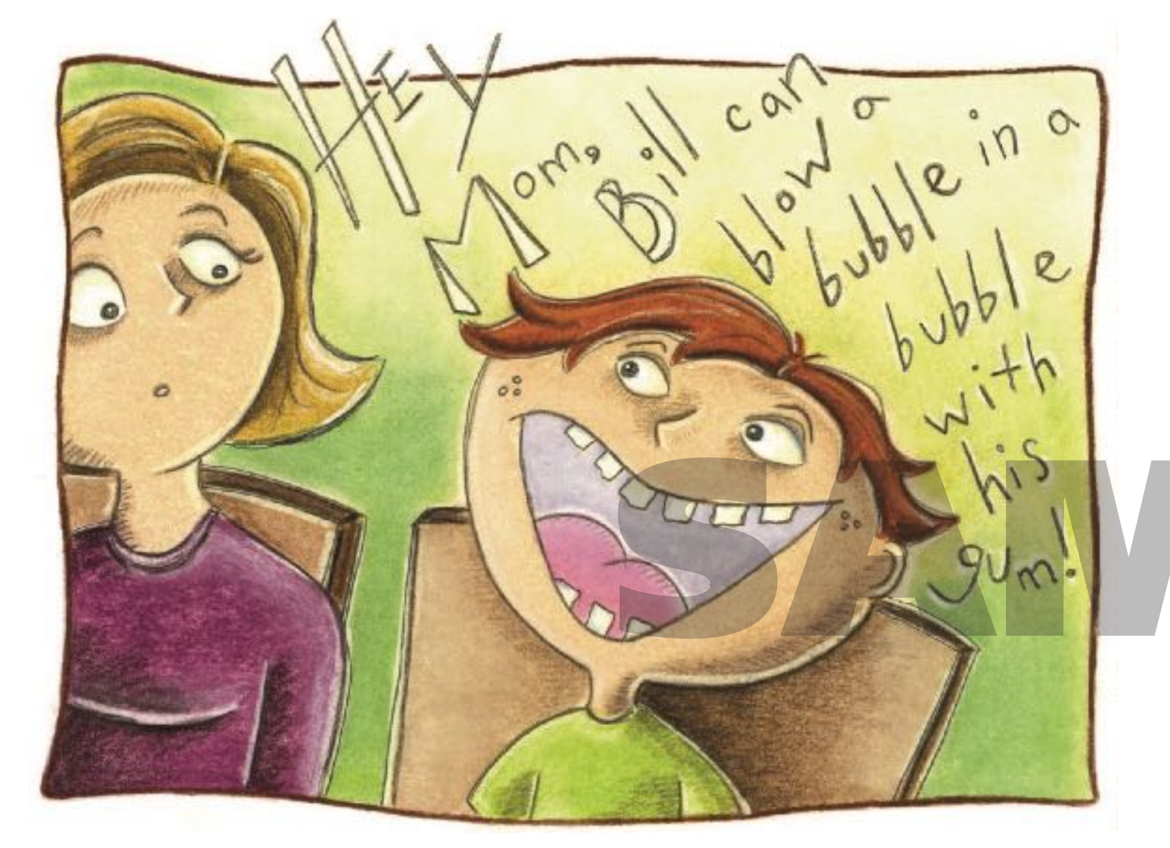
My tummy started to rumble, and then it started to grantle. My words began to wiggle, and then they did the juggle. My tongue pushed all of my very important words into my teeth and my volcano erupted!