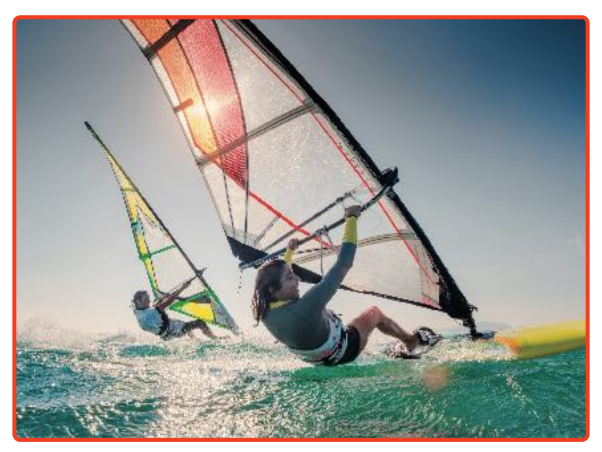
To "carve" a jibe, you lean into the turn.

A "jibe" is a smooth half turn away from the wind. To "carve" a jibe, you lean into the turn. You move the boom from one side to the other. The sail sweeps you through the curve.