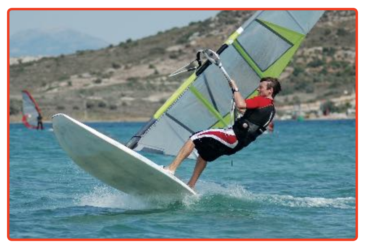
Lean back a bit to lift the mast up.

Lean back a bit to lift the mast up. Then bend down and pull the rig up toward you. Put both hands on the mast just below the boom. Let the sail flap. This will show you which way the wind is blowing.