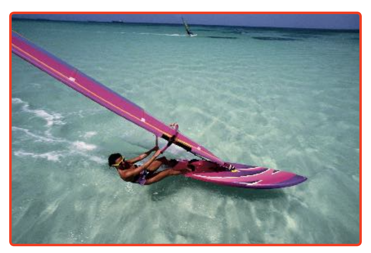
Wind surfing is not like sailing a sailboat.

Swing the rig around to the tail to move into the wind. Swing the rig toward the nose to head downwind.