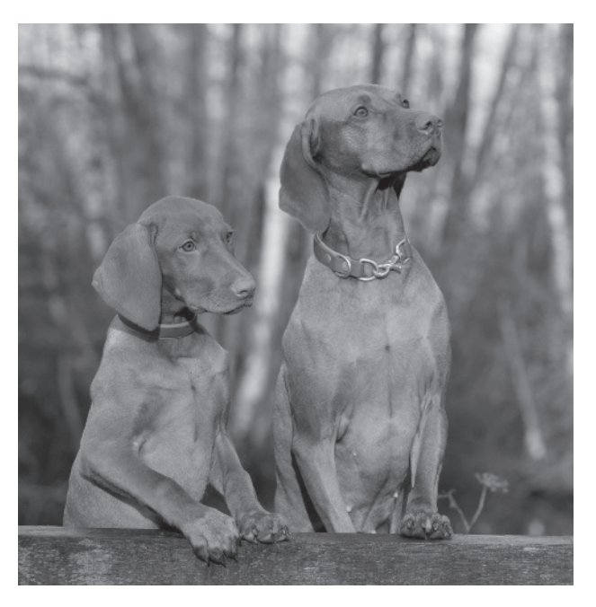
Who are the dogs waiting for?