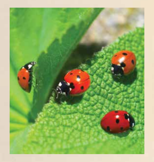
Four ladybugs are eating leaves.