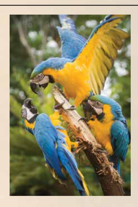
Three parrots are perched together.