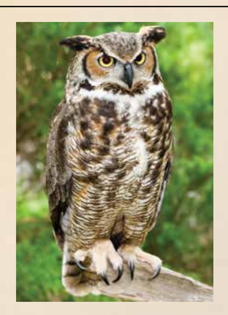
One owl is sitting on a branch.