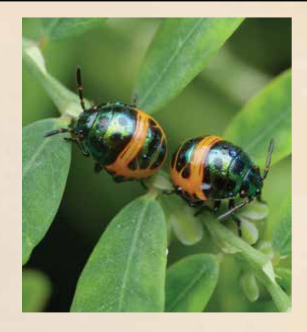
Two bugs are resting on a leaf.