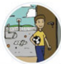
Walk in from recess