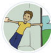
Refuse to walk in