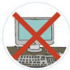
No computer time