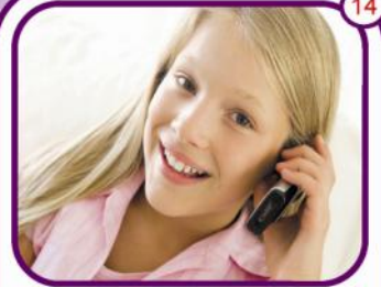
Daisy is calling a friend.