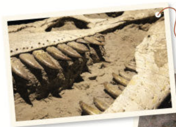
Body Fossil (TEETH)

Fossils help report the past. Fossils of fish and shells found high on mountain slopes show where the sea used to be. Fossils of water-loving plants found in the dry desert show that the climate has changed.